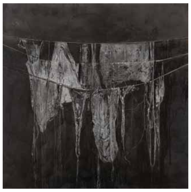
Untitled, Laundry Series, 2011, Mixed Media on Canvas, 100x100cm -Courtesy of Ayyam Gallery.

Although he began this body of work from three simple lines, the abstract expressionist painting style that he was known for prior to embarking on the "Laundry Series" quickly emerged. With its vigorous markings and what he describes as "the cycle of construction and dismantling," resurfaced the appearance of Sweida-like details. A 2008 painting in which thin lines of rope are strewn horizontally across the canvas demonstrates this as the composition is separated into distinct areas, adding dimension to an otherwise flat surface. In this work there are several components. First is the original canvas, which Azzam has painted with varying brushstrokes. The upper portion of the composition is covered in a near-solid area of white with the