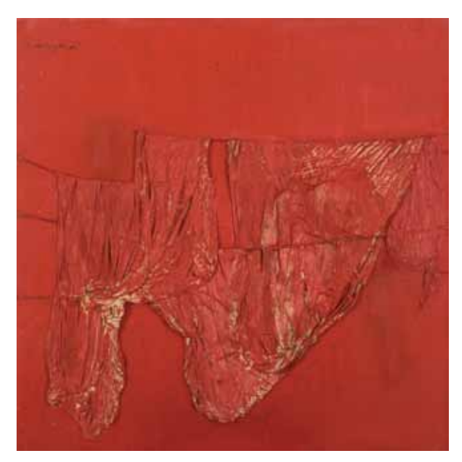
Untitled, Laundry Series, 2011, Mixed Media on Canvas, 100x100cm -Courtesy of Ayyam Gallery.

considered in an organic state, where the driving force of their arrangement would be solely "the mechanisms of creation." Focusing on technique and experimentation, each painting is a variation of this formalist theme. For Azzam, the benefit of working from such methodology is that it facilitates the creation of an artwork as a "hybrid form," one that is capable of borrowing and multiplying as it evolves. Each painting belonging to the series is labelled "untitled," as though indicating that its importance is situated within a larger set of continuous experiments.