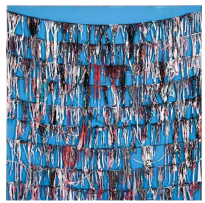
Untitled, Laundry Series, 2010, Mixed Media, 200x200cm

Take for example another work from 2008 in which a composition is constructed from a similar employment of a painted black canvas with white washes and three central horizontal lines. Although slight fissures appear in between broad, pallid films of paint, the artist has moved his focus to strips of cloth that hang from clothespins on a series of axial strands. These long columns have been flattened against the canvas with paint, their black colour hidden beneath its thick texture. A yellow tint to these cloths gives the appearance of burns, as though the artist has taken a