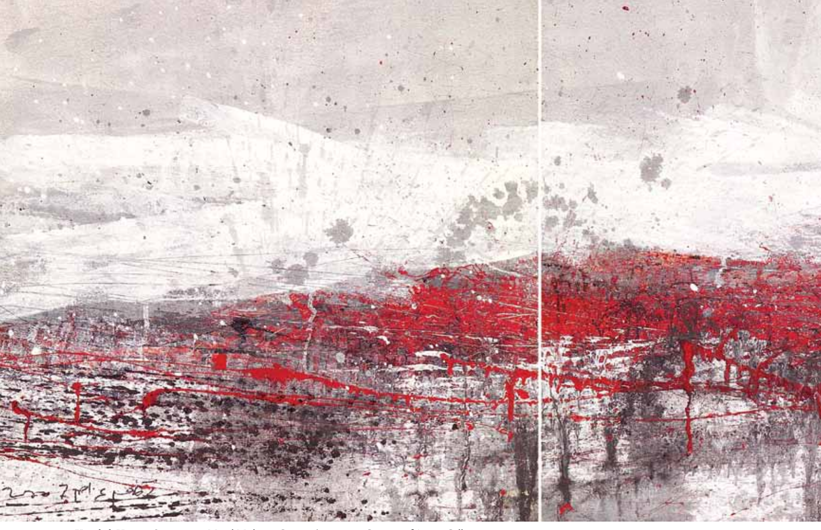
Untitled, Horizon Series, 2007, Mixed Media on Canvas, 60x181cm - Courtesy of Ayyam Gallery. 200<sup>°</sup>

pieces, of what can be presumed to have been articles of clothing, alter the appearance of the "Laundry Series" altogether. Crude ropes that also hang from the top line of the axes are woven in between, creating unintentional arabesques. In subsequent works, he turned to the use of collage to strengthen this weighty surface, placing newspaper clippings amongst the folds of the cloth while allowing areas of the canvas to be determined by the varying hues, texts and camouflaged images of their pages. Colour was also incorporated into the background of the composition in 2010, in works that increased the number of lines from which strands of hanging material occupied the length of the canvas. By first covering the canvas in a solid, effervescent colour, such as florescent yellow or blue, he was able to accentuate the hundreds of shredded pieces of cloth that hang from multiple suspensions. This not only creates a clear distinction between the background and the foreground even though the composition lacks the illusion of depth-it makes the shadows that are cast