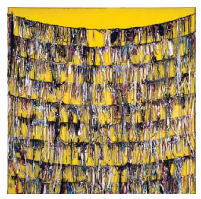
Untitled, Laundry Series, 2010, Mixed Media, 200x200cm - Courtesy of Ayyam Gallery.

the composition have also been painted over in white. Distributing a number of clothespins in groupings along these lines, the artist offsets the explosion of random texture and medium that occurs just below. Azzam also creates a two-dimensional surface with these pins. Emphasizing this sense of depth are the shadows that are cast from these objects onto the canvas, which give the illusion that his "clothesline" is detached from the surface, hanging in mid-air. If in the early stages of his "Laundry Series" the artist appears to have been interested in juxtaposing the materiality of these found objects with the sensorial experience of art that quickly gave way to the complete synthesis of these seemingly disparate qualities.