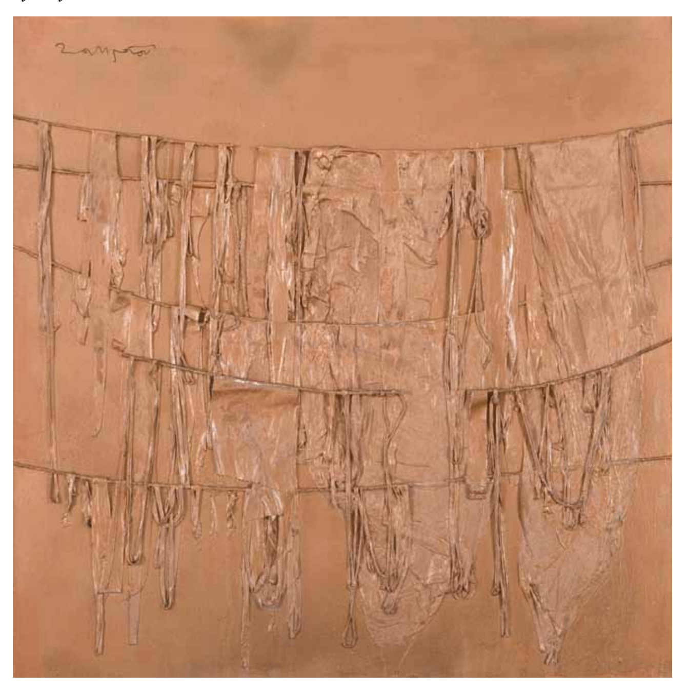
Untitled, Laundry Series, 2011, Mixed Media on Canvas, 180x180cm - Courtesy of Ayyam Gallery.